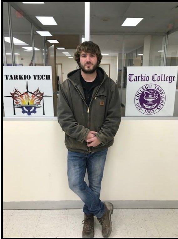
First Student of Tarkio Technology Institute