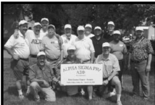
ALPHA SIGMA PHI REUNION ALUMNI WEEKEND 2006

We have also heard from the Alpha Sigs and here is what they have told us, "These Alpha's had a great time last year and talk has it we will see them again in June."